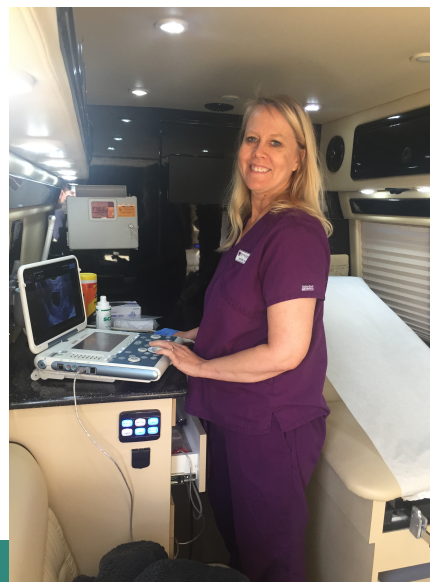
One of our nurses inside "Charlie," our mobile clinic.